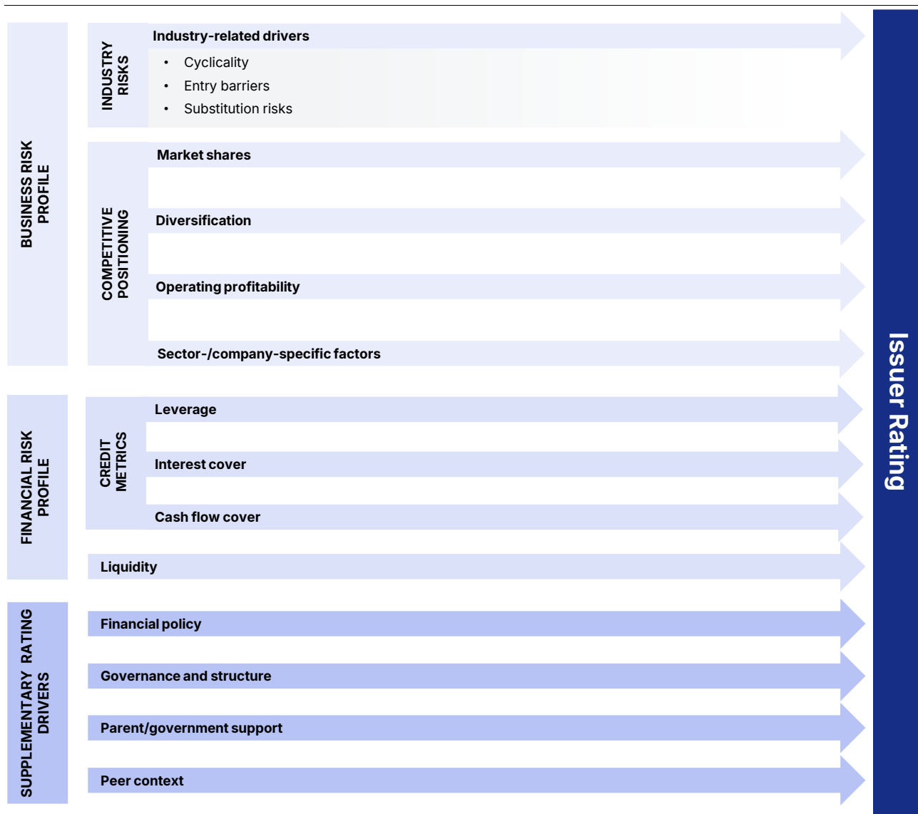
Figure 1: Scope's corporate rating approach